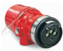
X3301/X3302 Multispectrum IR Flame Detector