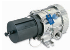
PointWatch Eclipse IR Combustible Gas Detector

DET-TRONICS Detector Electronics Corporation 6901 West 110th Street West Minneapolis, MN 55438 USA