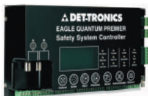
Eagle Quantum Premier Controller