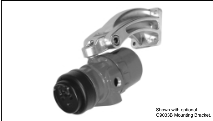
Shown with optional Q9033B Mounting Bracket.